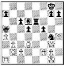
Position after 22 .....N-N5