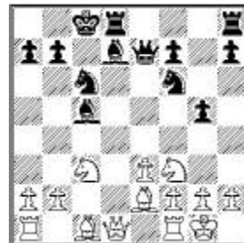
Position after 12 .....P-KN4