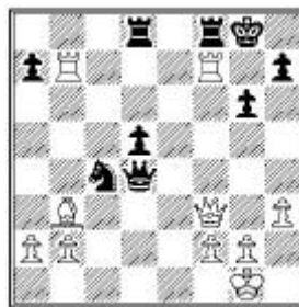
Position after 24 Nc4