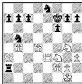
Position After 27 ..... K-B2

6 0-0 N(N1)-B3 7 R-K1+ B-K2 8 P-Q3 0-0 9 N(N1)-Q2 R-K1 10 P-QB4 PxP 11 N(Q2)xP B-N5 12 B-Q2 BxB 13 QxB N-B4 14 RxR+ NxR 15 P-Q4 N-K5 16 Q-K3 N(K1)-B3 17 N(B4)-K5 N-Q3 18 R-K1 Q-K2 19 Q-QN3 R-K1 20 P-KR3 Q-K3 21 QxQ RxQ 22 R-QB1 N(B3)-K4 23 P-QN4 P-KB3 24 N(K5)-KN4 R-K7 25 P-QR3 R-R7 26 R-QB3 N-N4 27 R-K3 K-B2