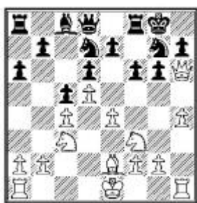
Position after 12.....P-QR3

This thematic move, aimed at queen's side expansion. is too slow. Black must take action on the king's side eg. R-KB2 with the secure N-KB1 in mind.