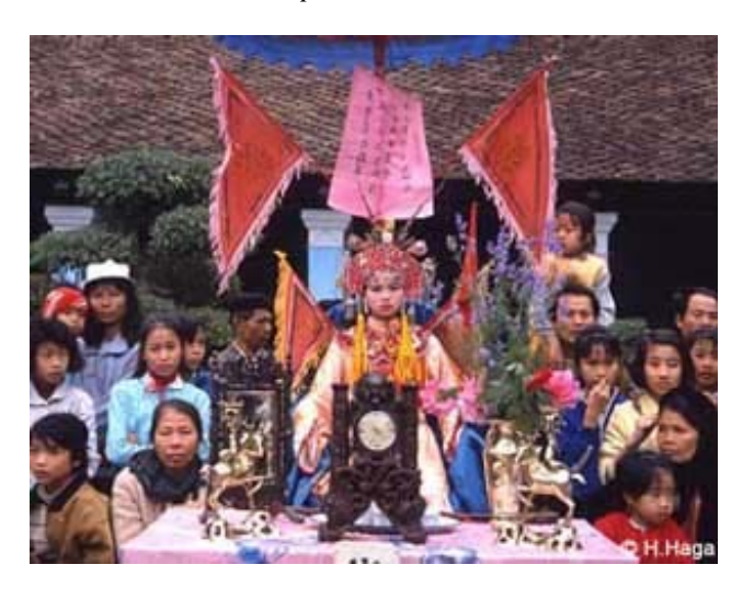
Human Chess of "Tet", New Year's Day

In Vietnam, New Year's Day is called "Tet" (I seem to remember that used to be considered offensive – Ed.)