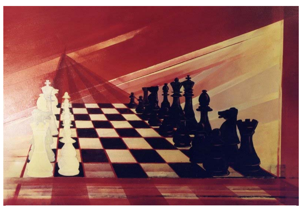
Another website picture gallery offering—Escape Squares by Gianfranco Pecis.