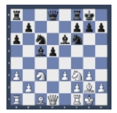
Black prepares to retreat the Bishop. I'm sure he would have preferred to play d4 but that fails to Na4.

Black's position is solid, or I'm short of good ideas. This pawn exchange at least creates an isolated Black pawn, forces his Bishop to move again, and gives me a piece to harry. 10... Bxc5 11.a3 a6