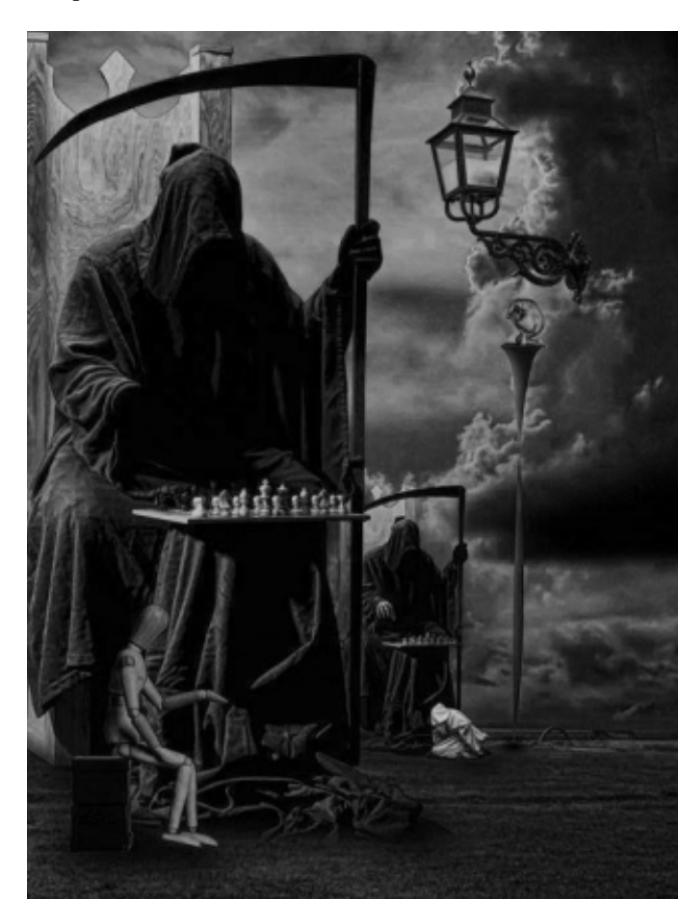
Reaper playing chess Chess on Pinterest - darkwoman.centerblog.net

own demise. Even so, in this particular game, I am reasonably confident that my opponent will soon do the decent thing and resign; so I am unlikely to have to make a complaint.