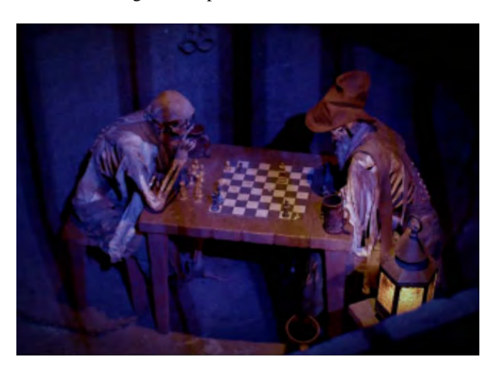
In the Disneyland, Florida, Pirates of the Caribbean ride, there are two skeleton pirates playing chess.

This particular SIM is also an IA who is highly placed in the ICCF and currently TO to more than 500 games in ICCF tournaments. But he was clearly not averse to playing "gamekeeper turned poacher" when irked by a prospective loss to a lower-graded "upstart".