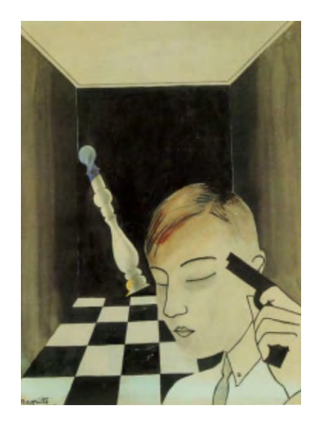
In Magritte's 1926 painting Checkmate , the bilboquet resembles a chess piece - the falling king.

Magritte was an avid chess player and several of his paintings use chess references, often the versatile icon (bilboquet) which can resemble a pawn or piece.