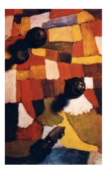
l'arte degli scacchi, gli scacchi nell'arte (the art of chess, chess in art)