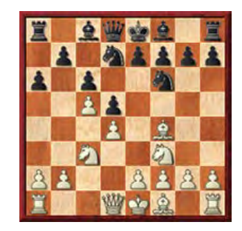
And again...! Now we have a 3-way repetition, which neither player claims.